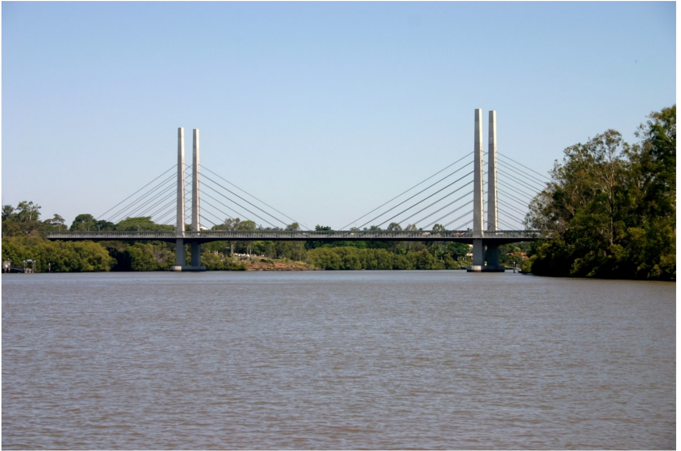
Spectator Vantage Point-Eleanor Schonell Bridge